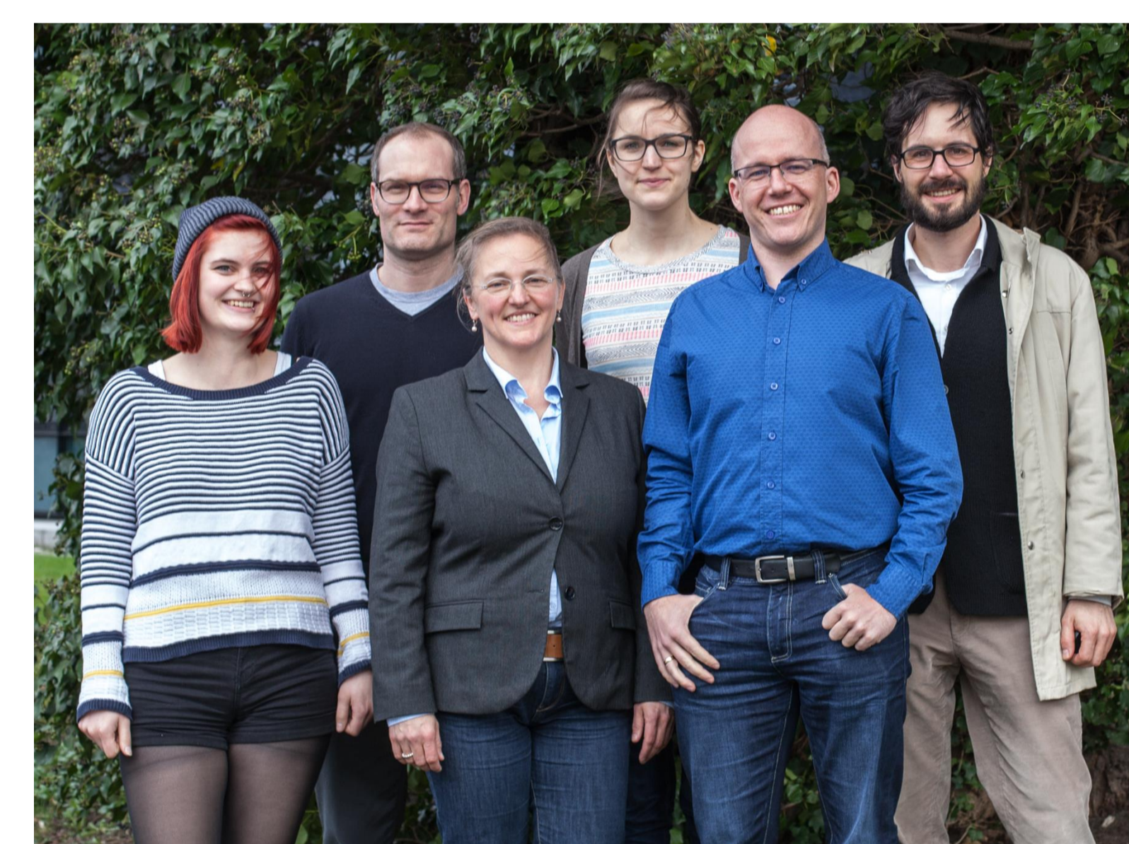
AP GOVERNANCE Freie Universität Berlin | Universität Vechta